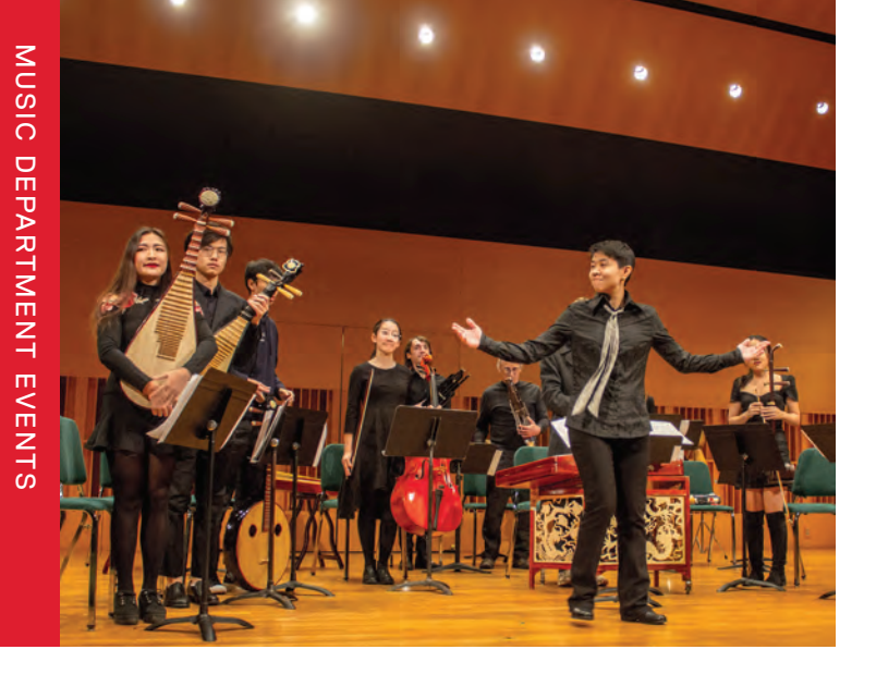
Chinese Music Ensemble (May 3)