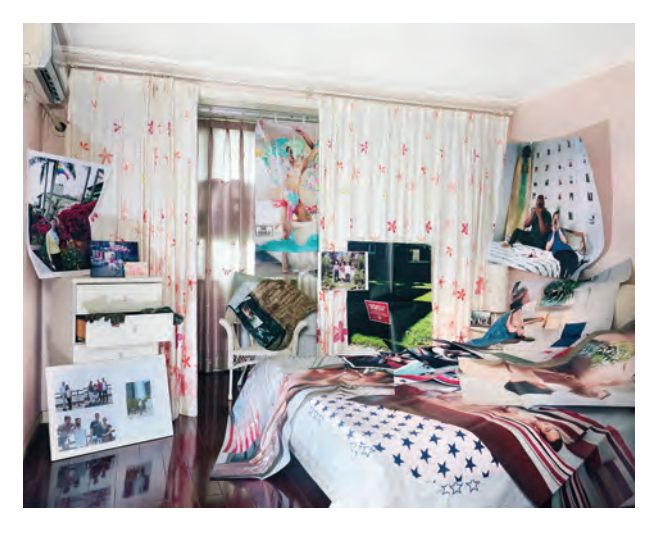
Guanyu (Gary) Xu, Temporarily Censored Home, 2018.